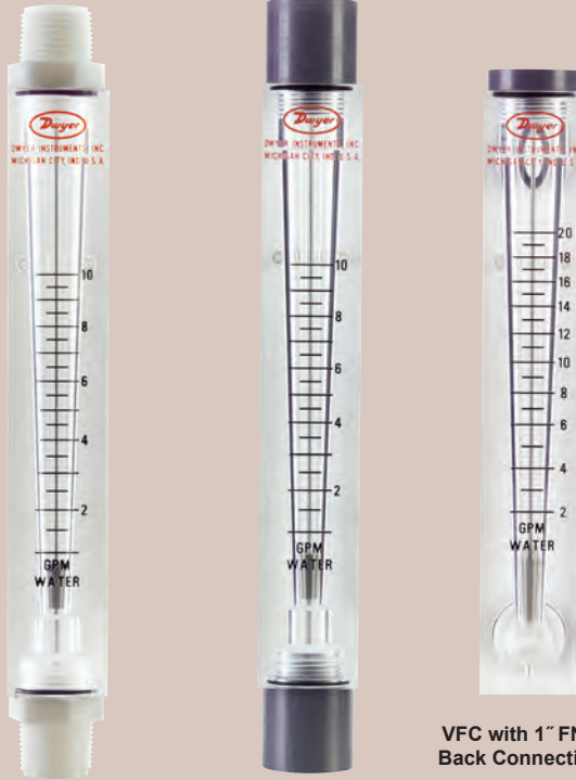
VFCII with 1" MNPT End Connections